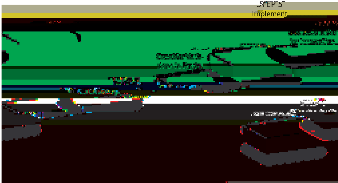
Figure 5: Step 2 of the Recruitment and Hiring System Toolkit

➡ Go to Step 2 of the Recruitment and Hiring System Toolkit: Benchmark